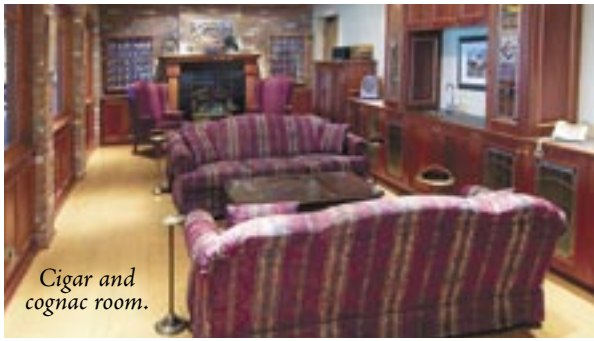
Cigar and cognac room.